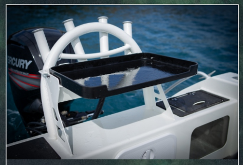
STANDARD HOOP STYLE BAIT STATION