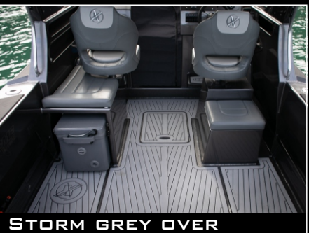
STORM GREY OVER BLACK KING PLANK