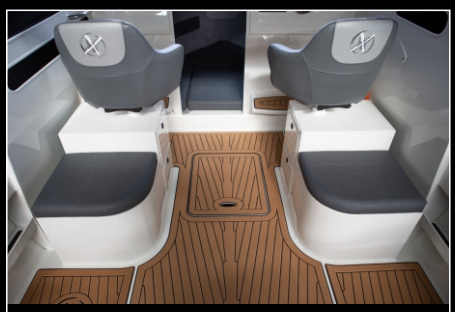
Mocha over Black King Plank