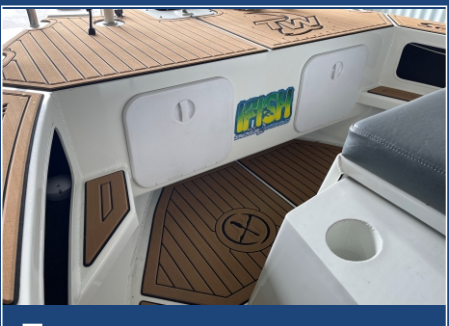
EXTENDED CASTING DECK WITH STORAGE