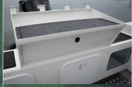
LARGE SINGLE DRAWER BAIT STATION