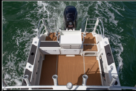
MOCHA OVER BLACK STRAIGHT LINES