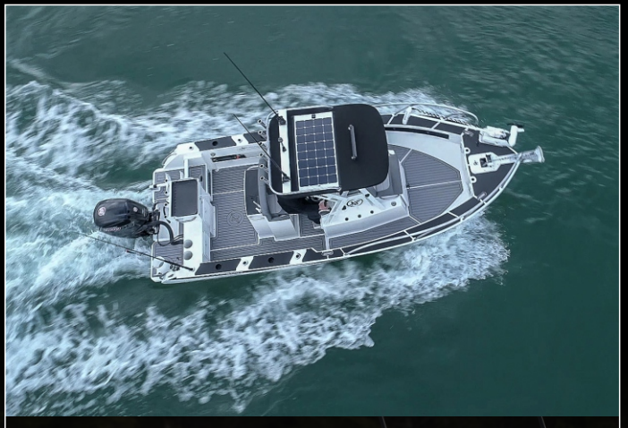
FULL SEADEK INCL COMPLETE TOPSIDES