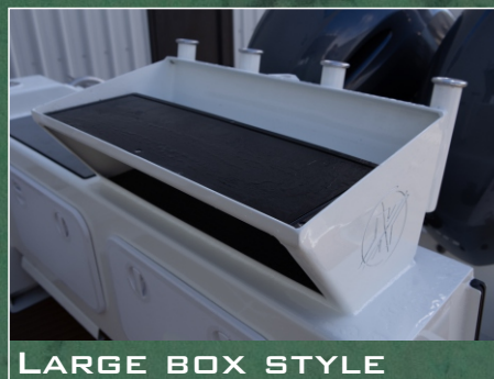
LARGE BOX STYLE BAIT STATION