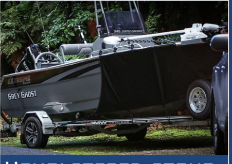
UPHOLSTERED STONE CHIP COVER