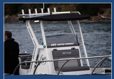
BILLETED TARGA FRAME WITH 6 ROD HOLDERS