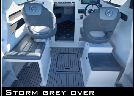
BLACK STRAIGHT LINES