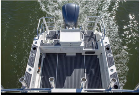
DARK GREY OVER STORM GREY STRAIGHT LINES