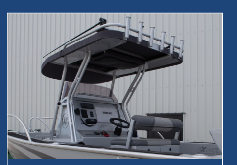
TUBE TARGA FRAME WITH 6 ROD HOLDERS