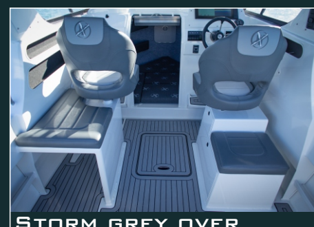
STORM GREY OVER Black straight lines