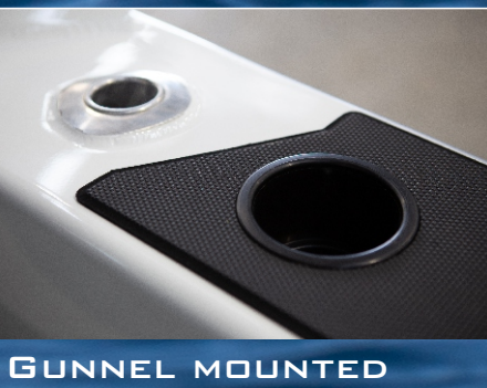
DROP IN CUP HOLDER