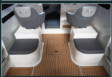
Mocha over Black King Plank