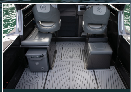
STORM GREY OVER Black King Plank