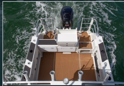
MOCHA OVER BLACK STRAIGHT LINES