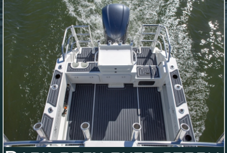
DARK GREY OVER STORM GREY STRAIGHT LINES